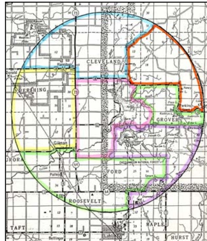
Gilman Christmas Bird Count Circle

as an alternative activity to an event called the “side hunt” where people chose sides, then went out and shot as many birds as they could. The group that came in with the largest number of dead birds won the event. Frank Chapman, a famed ornithologist at the American Museum of Natural History and the editor of Bird-Lore (which became the publication of the National Association of Audubon Societies when that organization formed in 1905) recognized that declining bird populations could not withstand wanton over-hunting, and proposed to count birds on Christmas Day rather than shoot them.”